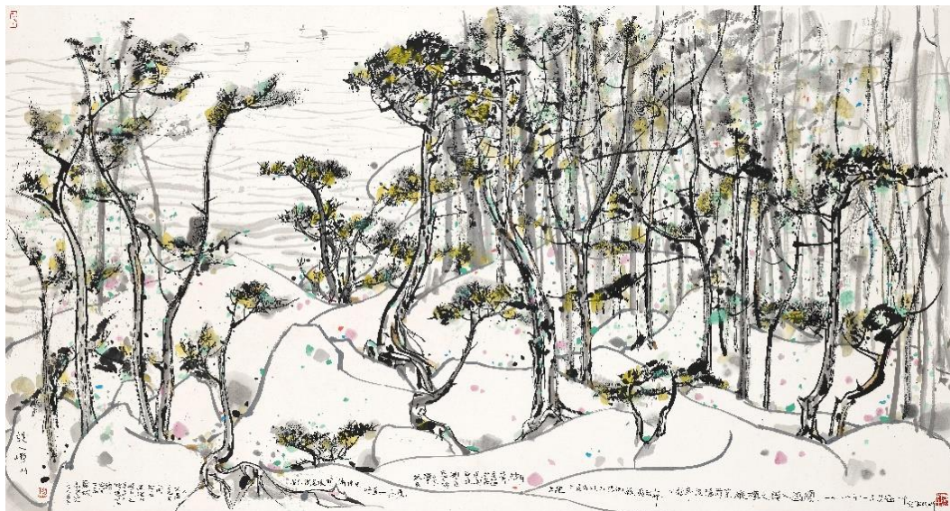
WU GUANZHONG (1919-2010) Scenery of Mount Lao

Scroll, mounted and framed, ink and colour on paper 96.2 x 179.3 cm. (37 7/8 x 70 5/8 in.)