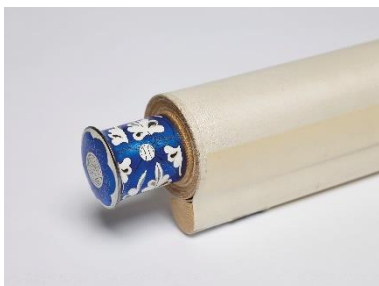
Tailor-made cloisonné scroll knob specially designed by Da Feng Tang, Zhang Daqian's studio

HONG KONG - From classical masters to modern pioneers, Christie's will offer an outstanding collection of coveted masterpieces for auction on 26 th and 27 th May. These masterworks represent pivotal moments in Chinese art history, with timeless works from leading Qing dynasty artist Zhang Zongcang, to 20th century masters such as Zhang Daqian, Wu Guanzhong, Fu Baoshi, and Li Keran.